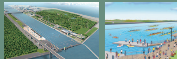
16 Sea Forest Waterway*