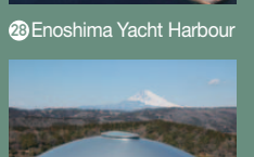
29 Izu Velodrome