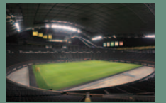
31 Sapporo Dome