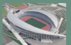
32 Miyagi Stadium