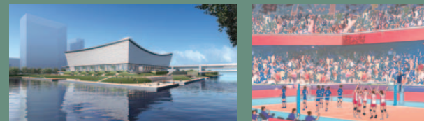
8 Ariake Arena*