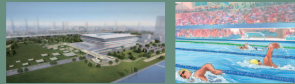
19 Olympic Aquatics Center*

The facilities will continue to be used effectively beyond the Games as sites for competitive sports, playing and watching sports, training young athletes, and other purposes.