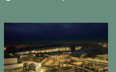
27 Makuuhari Messe