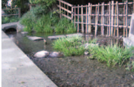
B Mamashita Spring