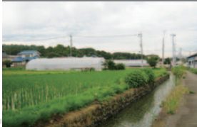
A Hino Irrigation Canal