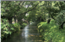
E Tamagawa Josui Canal