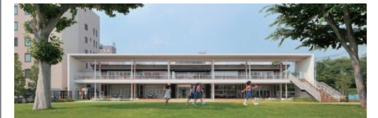
Tachikawa Kodomo Mirai Center The former Tachikawa city hall building was remodeled into a lively facility for children to gather.

Are you aware that Tokyo is a pioneer when it comes to public involvement in community planning? In the 1970s, with local community planning centers playing a central role, residents took the lead in launching and implementing various projects. In recent years I have turned my attention to "loose associations" formed when many different people gather in facilities built by public participation. While these associations are not as tight as those in families or companies, they can be useful in preventing such problems as senior citizens dying alone, or crimes that victimize children, and in solving other issues falling off the radar of municipal administrations. I believe that creating platforms for these human infranetworks to arise, and training people who can serve as coordinators in promoting such associations, will be necessary for future community building.