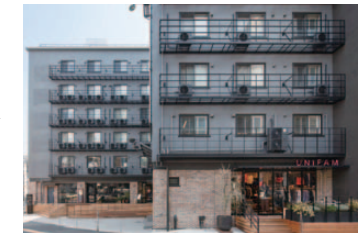
AFTER Commercial facility