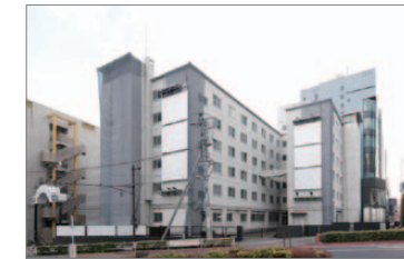
BEFORE Company dormitory for single employees