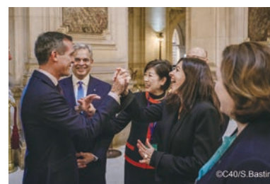
Governor of Tokyo, Mayor of Paris, and Mayor of Los Angeles at a C40 event

*C40's decision-making body consisting of the mayors (vice chairpeople) of 16 cities (as of November 2020), including Tokyo