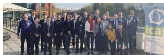
ICAP annual meeting

In May 2009, TMG joined ICAP as the only single city government entity and the first member from the Asian region. Since then, TMG has proactively shared its achievements and know-how with members with a view to disseminating cap-and-trade schemes.