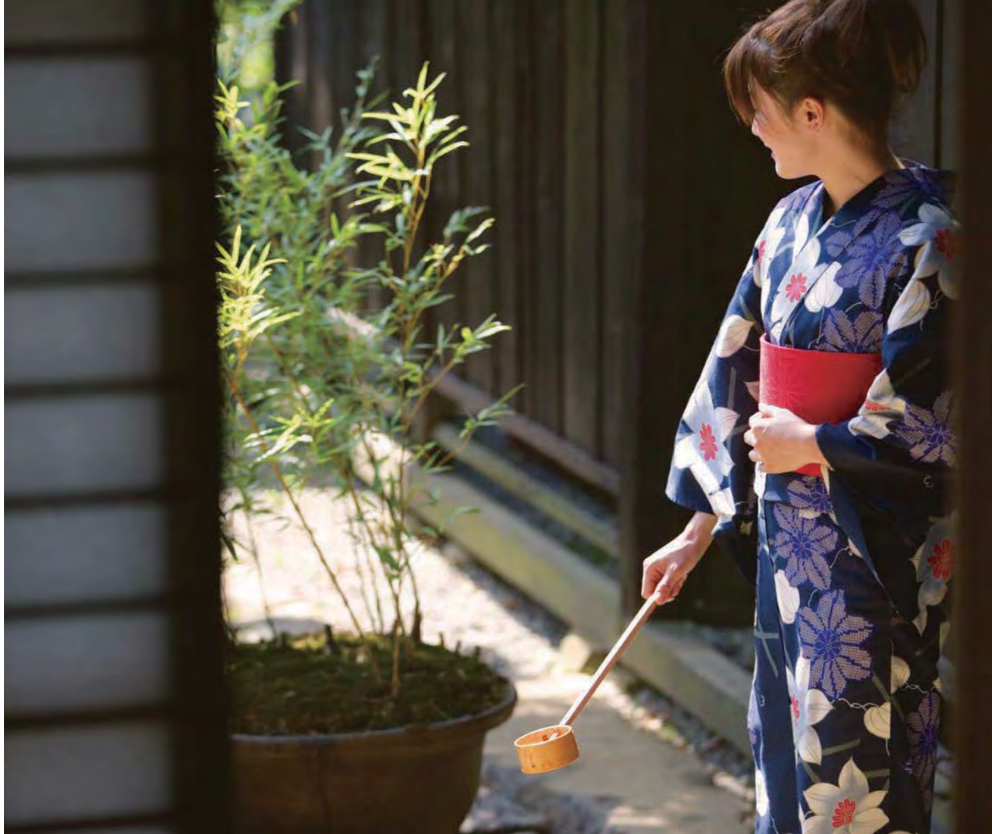
Uchimizu is the traditional practice of cooling off summer streets and garden walkways by sprinkling them with water.