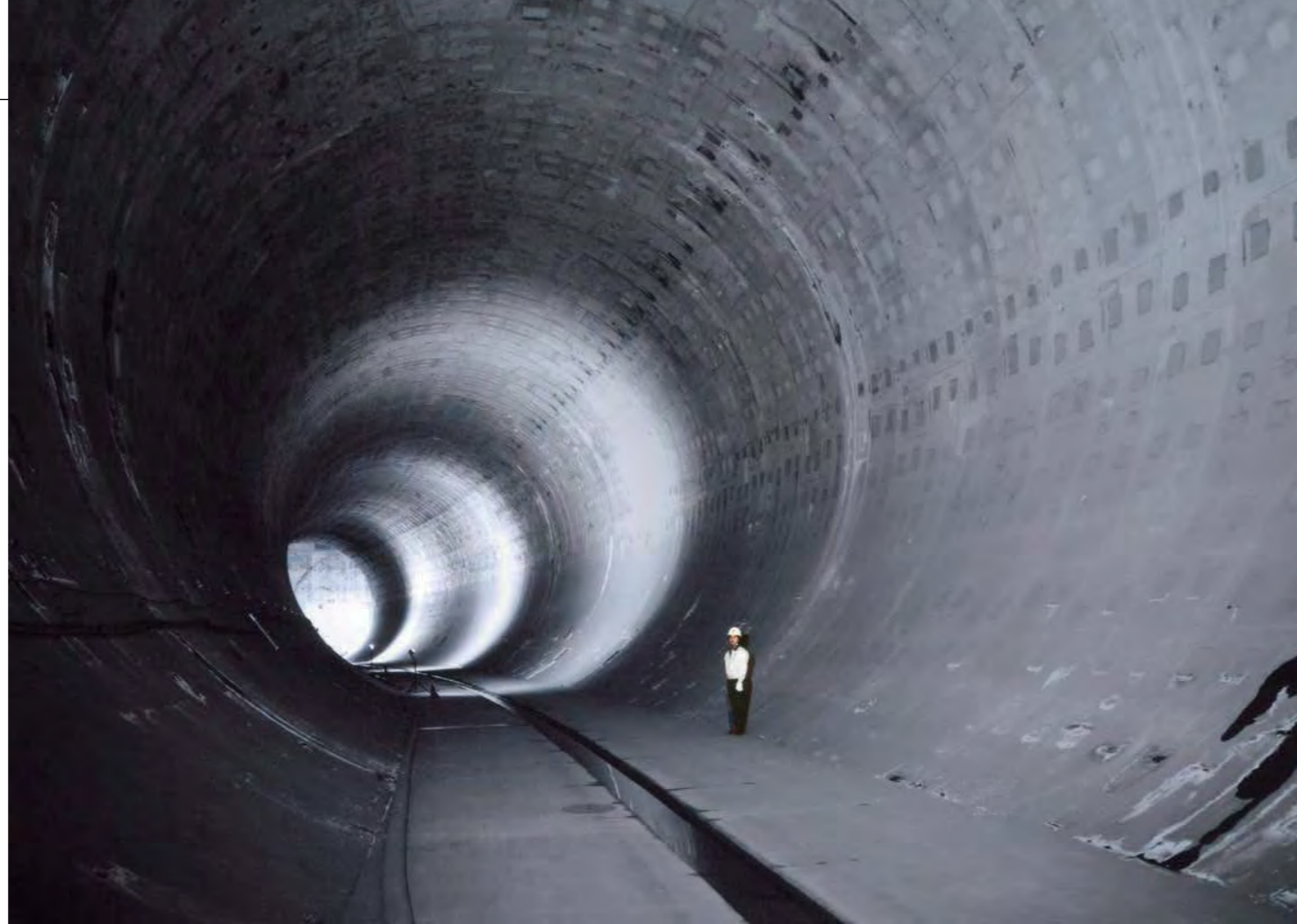
The massive Kanda River/Ring Road No.7 Underground Regulating Reservoir protects a large area of Tokyo from flood damage.

In the 1940s, 42 percent of the land around the Kanda River, which runs through eastern Tokyo, was still forests or fields that absorbed the water back into the soil. "However, due to rapid post-war urbanization and economic growth, the fields were paved to make way for roads and residential areas," says a Tokyo Metropolitan Government (TMG) official in charge of the project. "The rainwater had no outlet and flowed into the river all at once, often causing overflows."