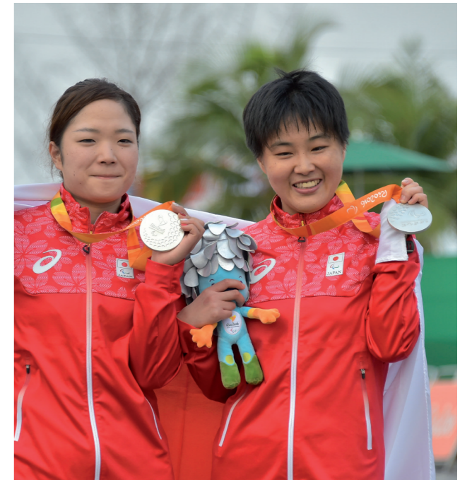
Celebrating after the event