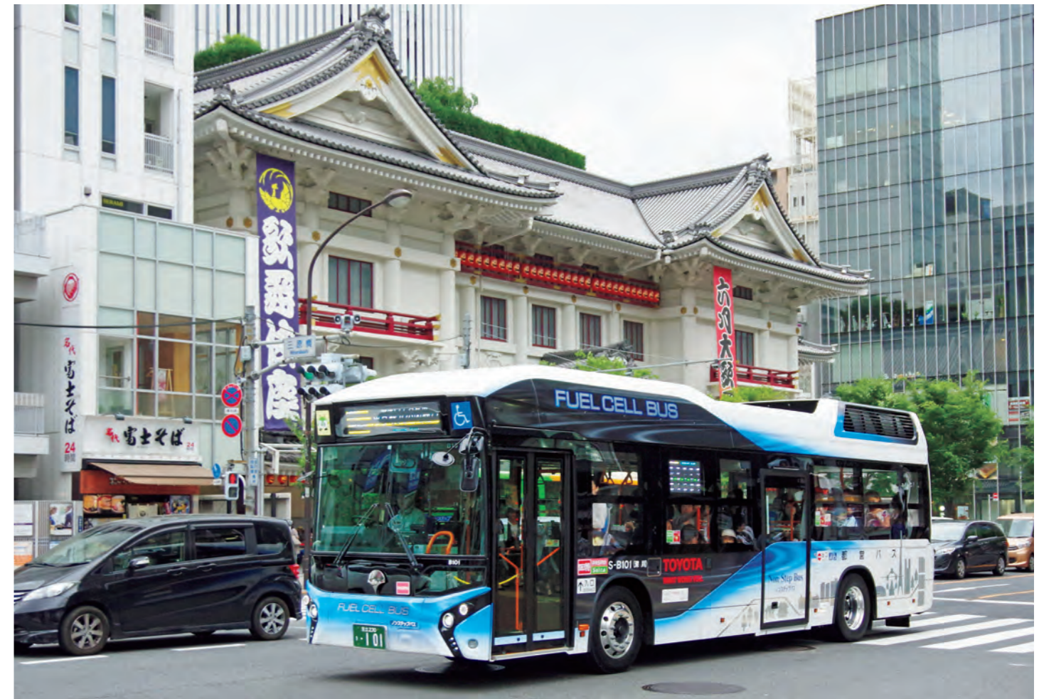
One of the city's eco-friendly FC buses runs smoothly past Tokyo's Kabukiza Theatre.

In addition to the buses, the Tokyo Metropolitan Government plans to increase the number of hydrogen-fueling stations, which are critical to support the