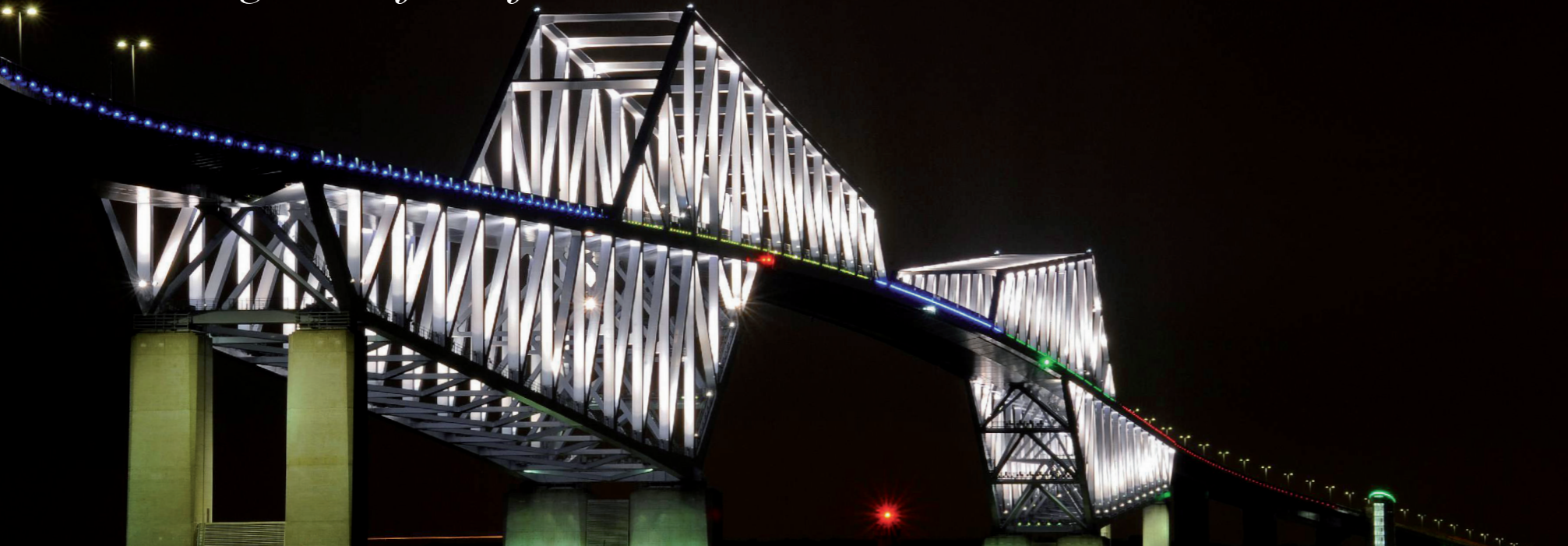
Tokyo Gate Bridge at night