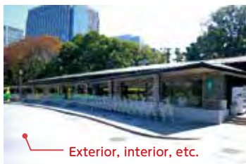
Exterior, interior, etc.