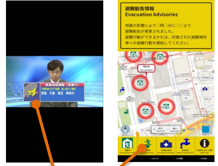
Information in times of disaster