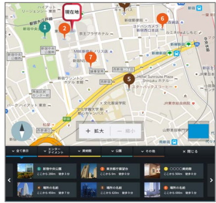
Directions displayed on touch panel screen