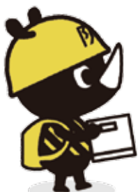
The official character of Tokyo Bousai "Bosai the Rhino"

Volunteer interpreters will assist in all the training, so please don't hesitate!