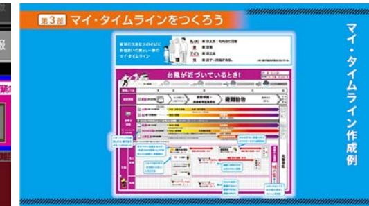
Part 3: Make your Timeline