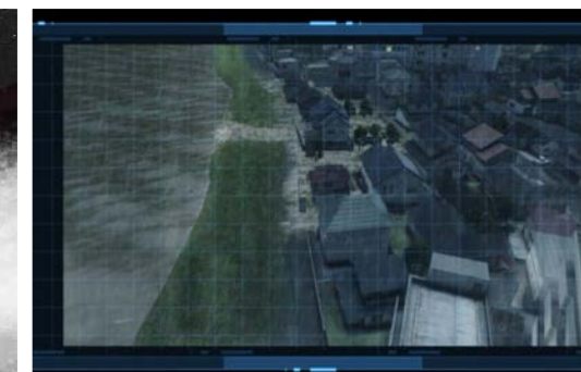
Learn about disaster prevention

【VR Experience of flooding from high waves】