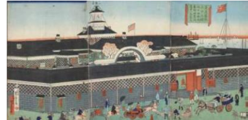
Tsukiji Hotel exterior

TMG will henceforth hold discussions with the Operator and others to brush up the plans proposed by the Operator and promote urban development that will lead to the sustainable growth of Tokyo.