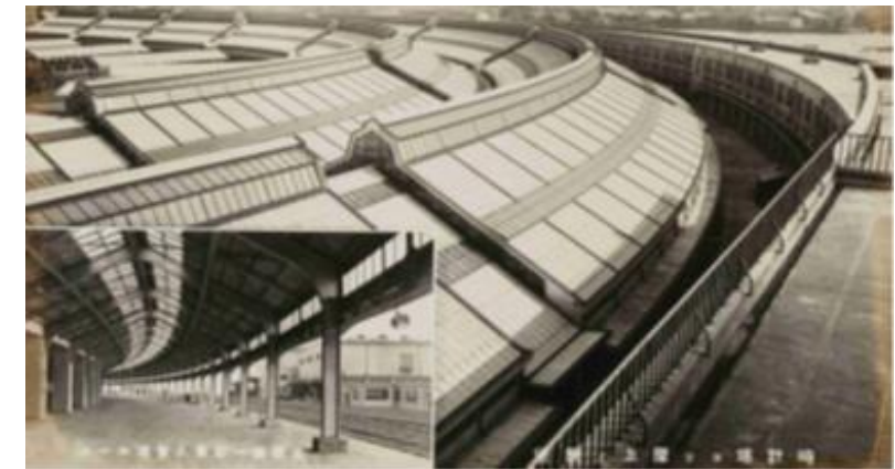
Former Tsukiji Market