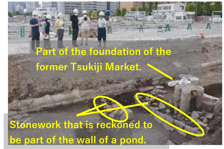
Status of the investigation of buried cultural properties

For more detailed survey information, visit the “Tsukiji District Development Project” page on the Bureau of Urban Development’s website. ( https://www.toshiseibi.metro.tokyo.lg.jp/bosai/toshi_saisei/saisei08.html ).