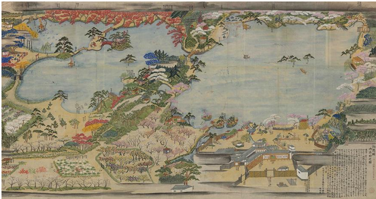
A whole view of Edo Yokuon-en

The Tsukiji district has a history of having been the former site of the “Yokuon-en,” a post-retirement residence of Matsudaira Sadanobu, who served as a senior councillor in the Tokugawa shogunate. Since the end of the Edo period (1603-1867), naval facilities were developed here. In 1935, Tsukiji Market was established, serving as the center of the nationwide food trade until it was relocated to Toyosu in 2018.