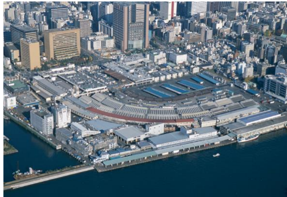
Former Tsukiji Market