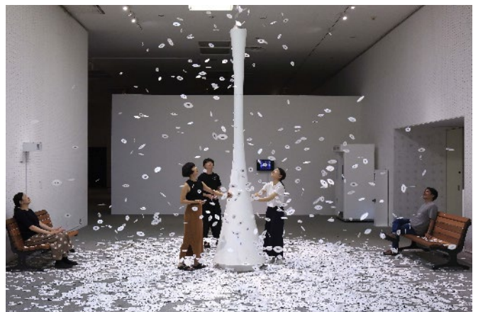
Blinking Leaves, 2003