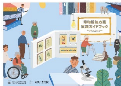
Session ④ Japanese edition of the National Taiwan Museum’s “Museum Prescription: A Practical Guidebook”. Published by Tokyo Metropolitan Art Museum

Speakers: Maiko Sato (Art/Museum Educator) Cathelijne Denekamp (Rijksmuseum Amsterdam) Moderator: Kasumi Yamaki (Museum of Contemporary Art Tokyo)