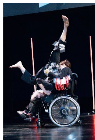
Session ⑥ Toyohashi Arts Theatre “PLAT Theater Tour for the visually and hearing impaired”