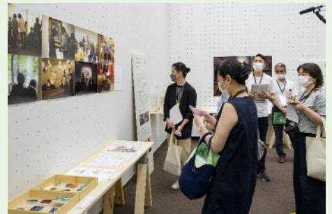
2022 International Conference