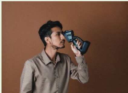
QD Laser Retissa On Hand